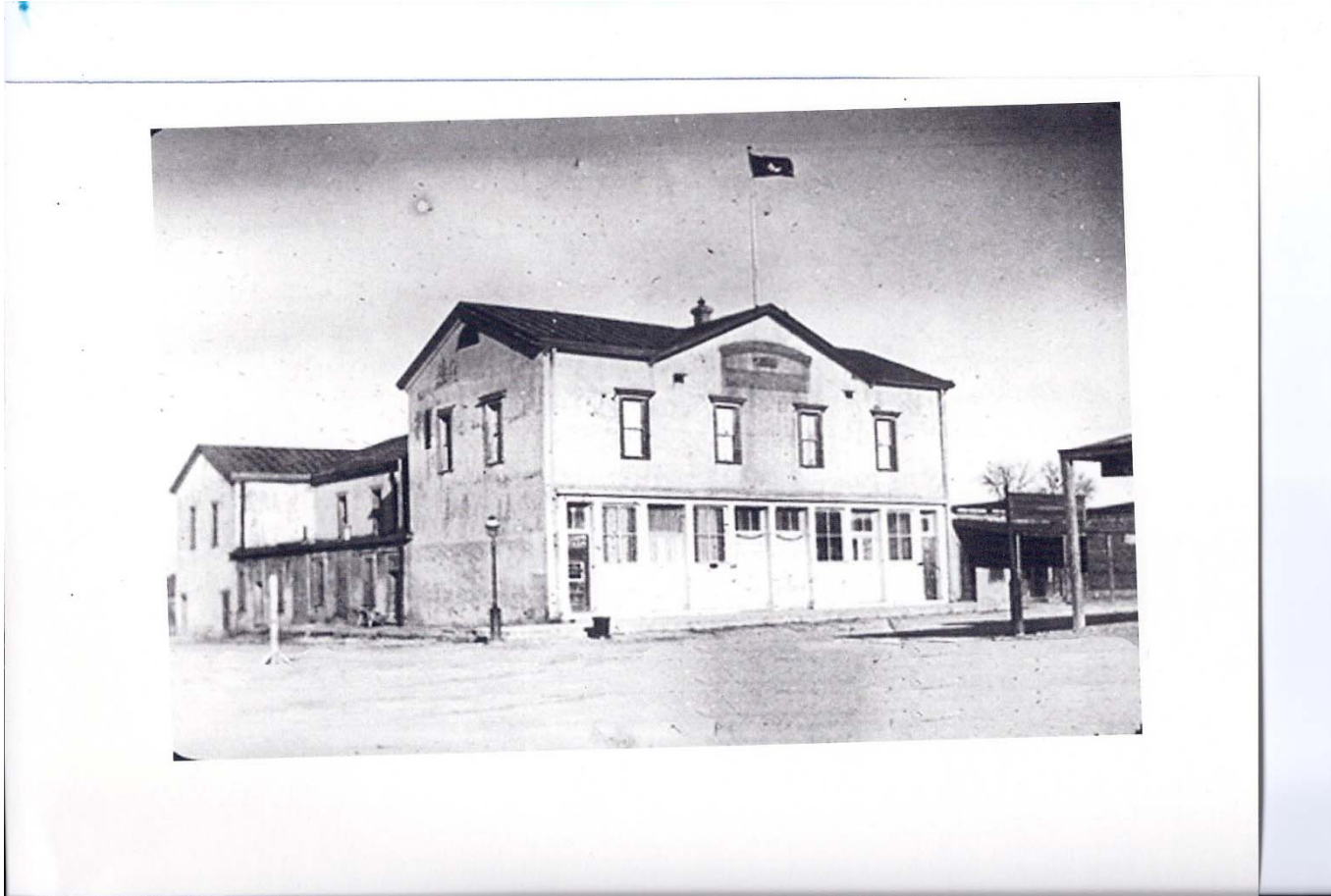
Historic Schieffelin Hall