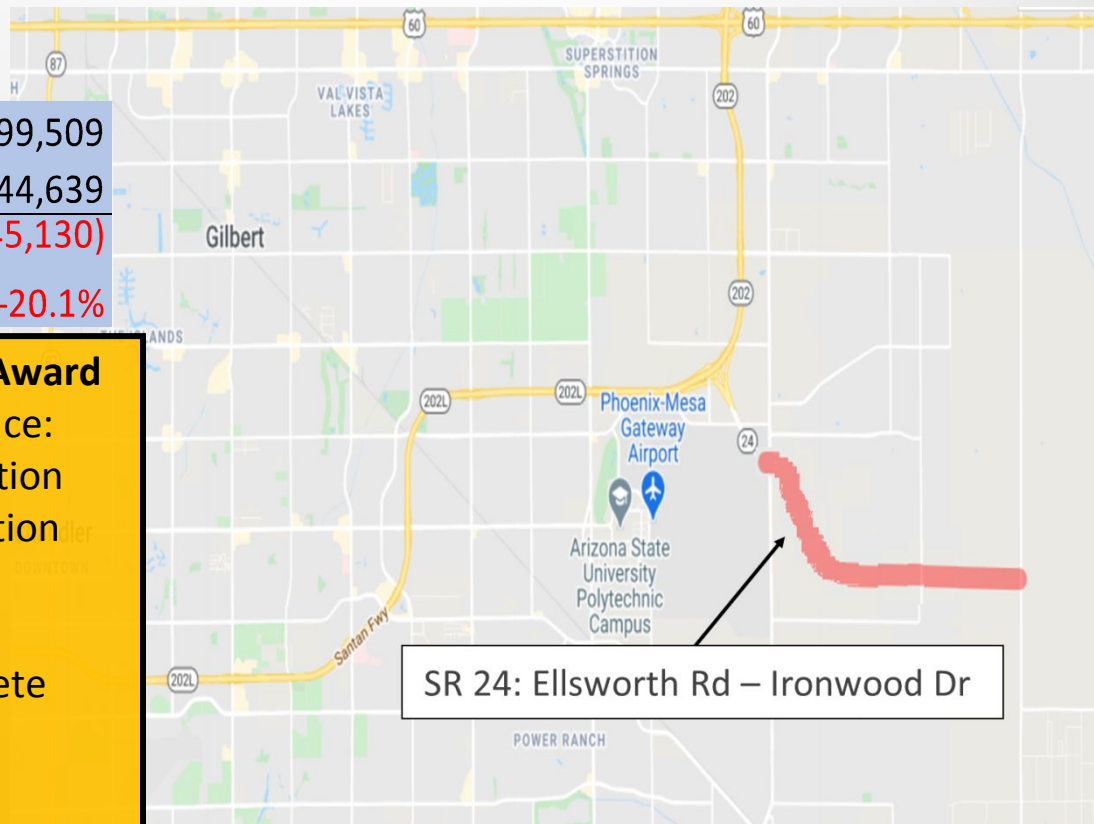
SR 24: Ellsworth Rd – Ironwood Dr