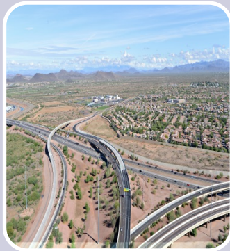
SR 51, Black Mountain Blvd.