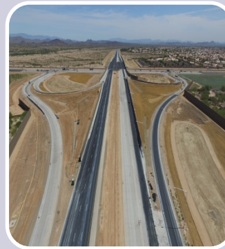
US 60 / L303 TI