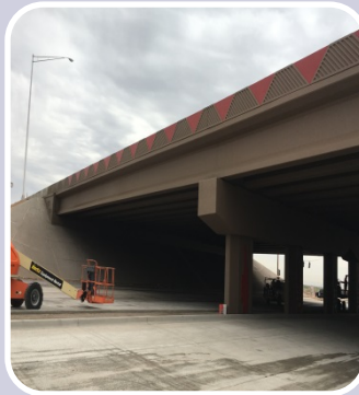
L303, El Mirage Rd. TI