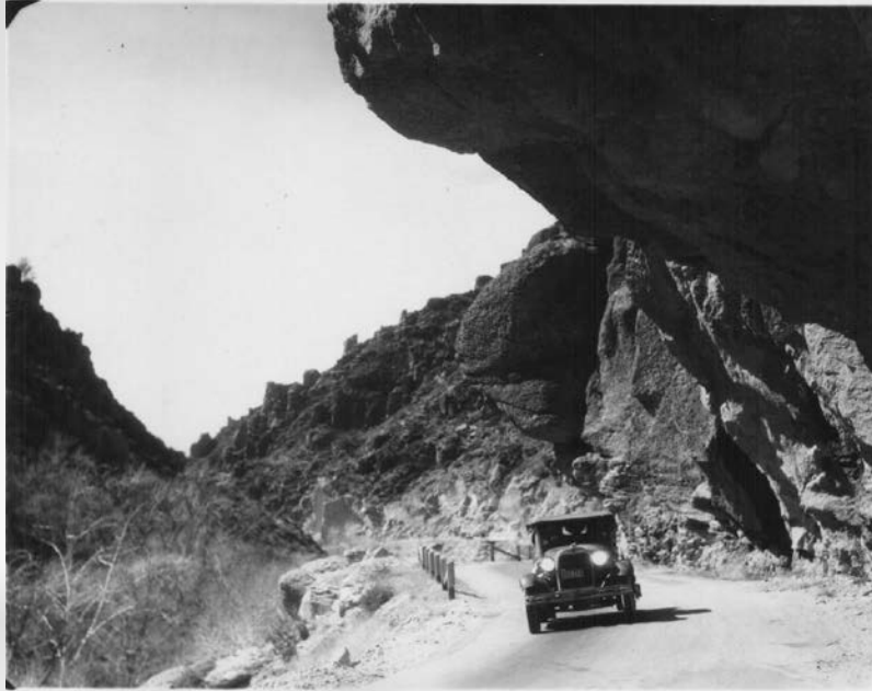
Historic Photograph Number 337 - 7/1/1933 - Queen Creek Canyon Superior-Miami Overhanging cliffs