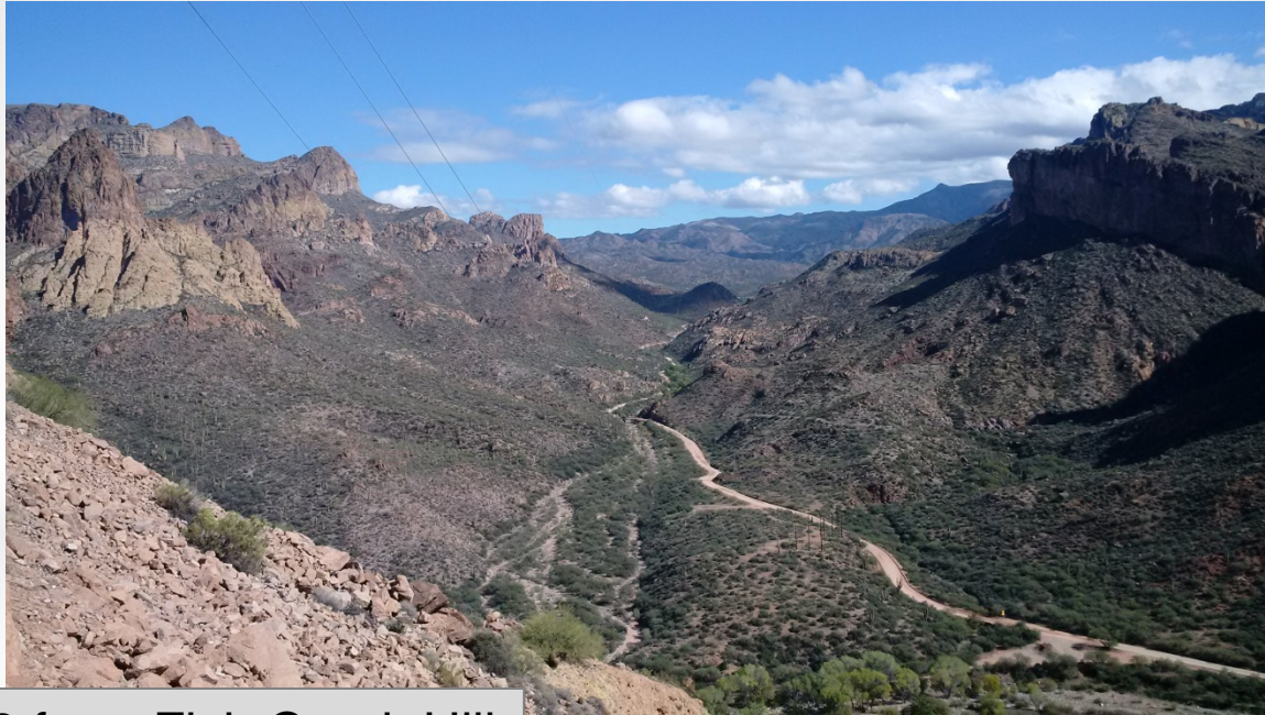
SR88 from Fish Creek Hill