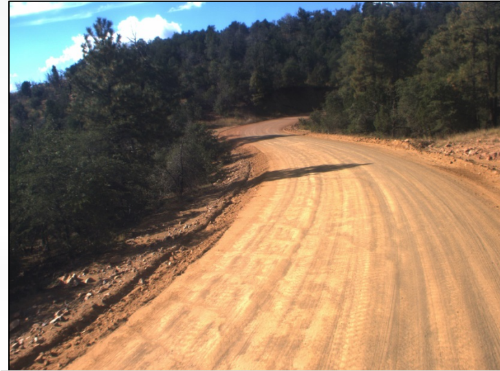
SR288 Northbound Milepost 299