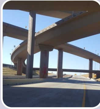
I10/303 Phase II