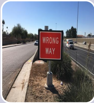
I17, Wrong Way Driver