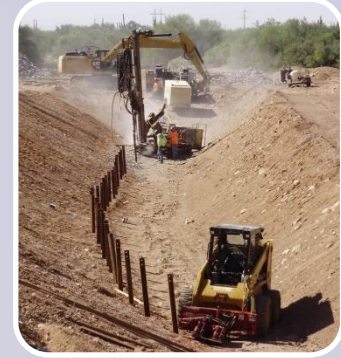
SR88 Emergency Repair