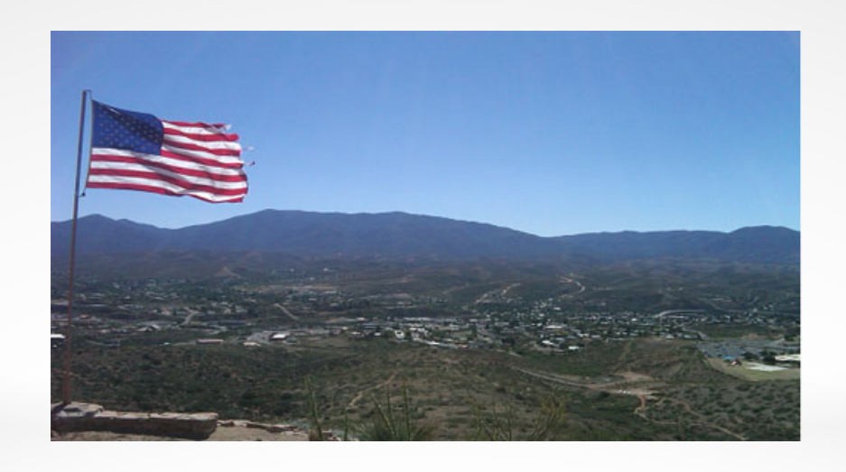
Round Mountain Park Overlook