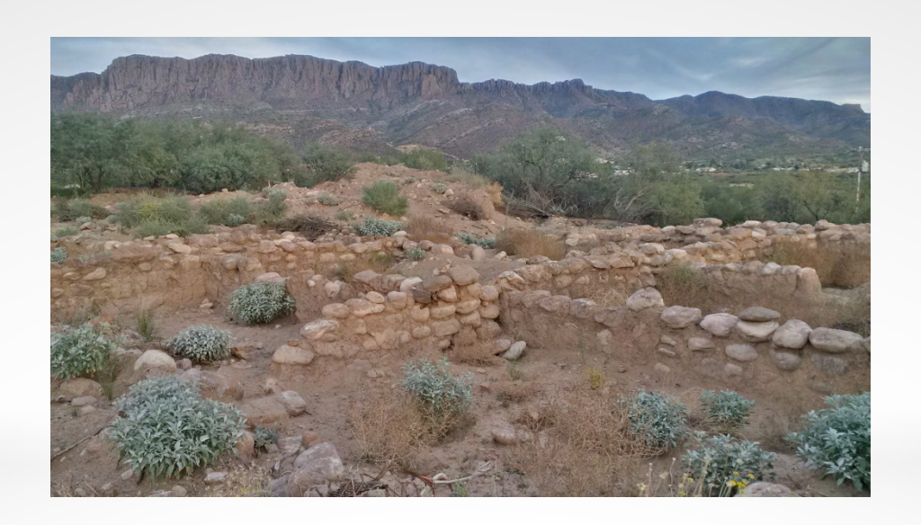
Old Pueblo in Superior