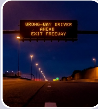
SR 202 FMS – Ray Rd to Broadway Rd