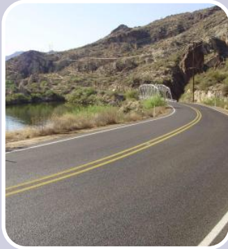
SR 88 – Apache Jct to Tortilla Flats