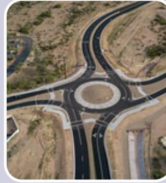
SR 88 Apache Trail