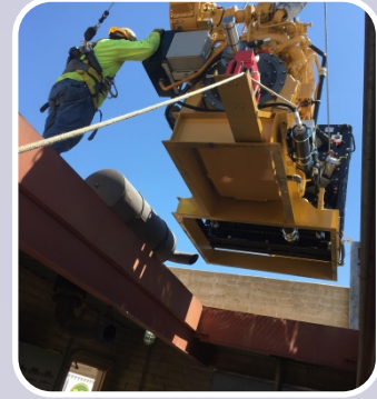
US 60 – 48 th St Pump Station Rehab