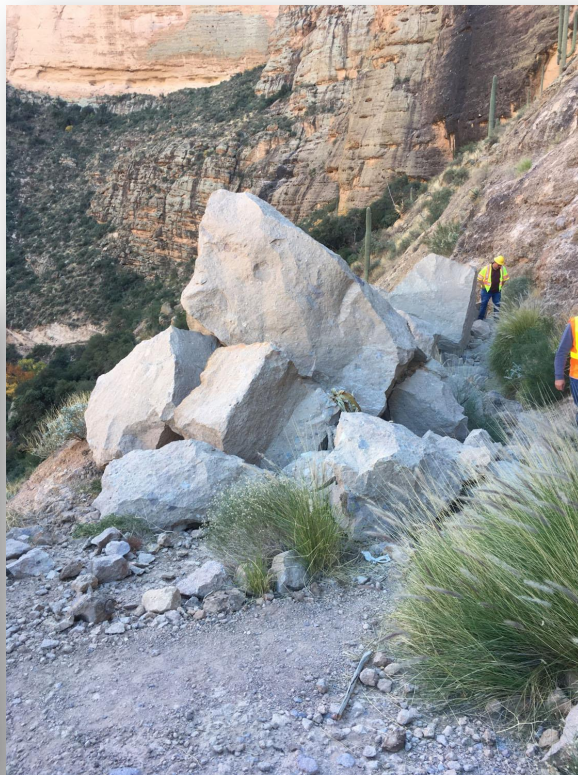
Boulders blocking Fish Creek Hill on SR 88.