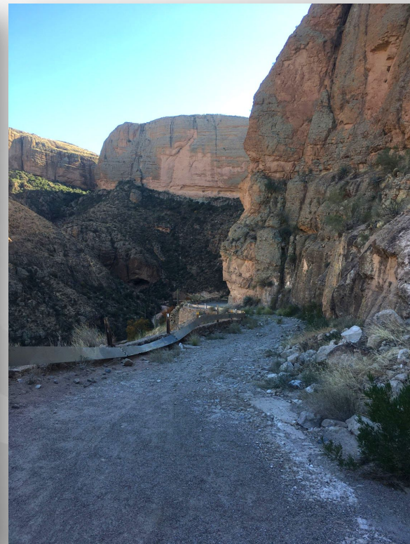
View from further up Fish Creek Hill.